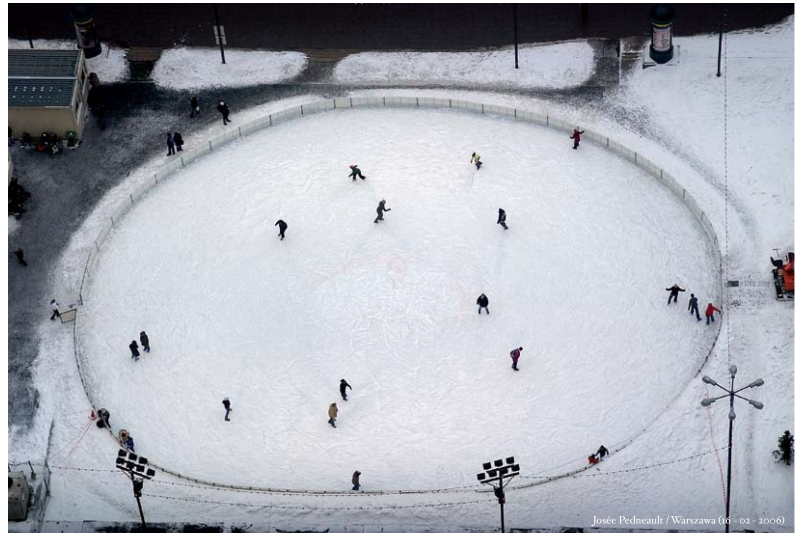
Warszawa (16 - 02 - 2006)